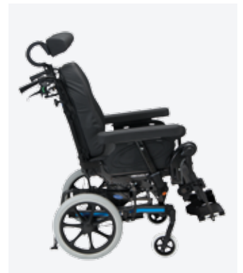
The DSS with the high pivot point for the backrest which provides minimum shearing when reclining.