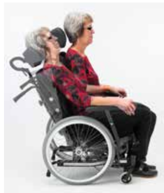
Dahlia 30° with self tilt for the user who can actively change posture.