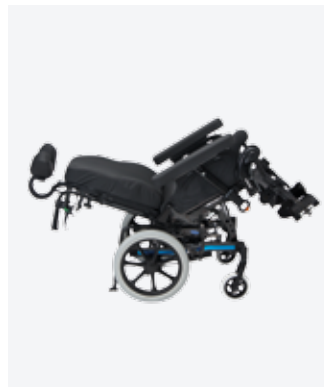
Dahlia 45° for optimum pressure relief of the user's posterior.