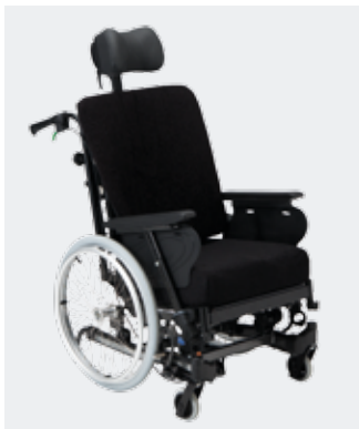
Dahlia 30° for foot propelling with a seat height of 32,5 cm.